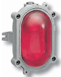
0947 08 Oval bulkhead light