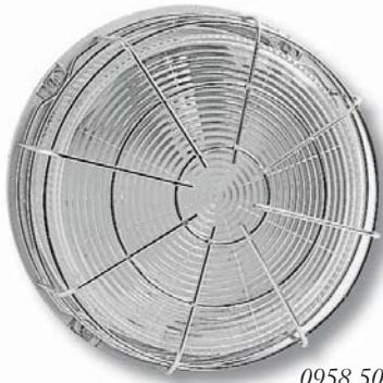
0958 50 + 0958 55