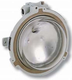
0947 54 round bulkhead light