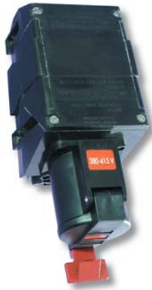
Wall mounting sockets 0977 27